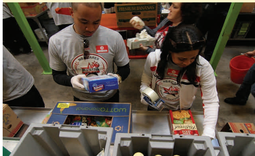
Food Bank Volunteers